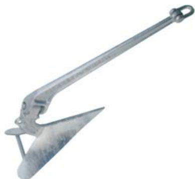
CQR (plow) anchor

Your 'ground tackle' will be made up of an anchor, a length of chain (at least as long as your boat) and the warp, usually three-strand nylon rope long enough to be at least seven times the average depth of the water you expect to anchor in, probably longer in lakes. Your chandler can advise what size chain, rope and anchor is best for your boat, but generally I find that it's best to use the strongest and heaviest you or your crew can manage.